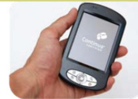
Electronic Media / Software

Continua member companies will select connectivity standards and publish Guidelines for strict interoperability.